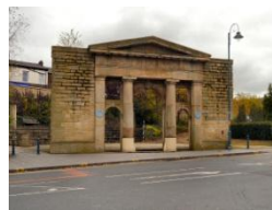
Stalybridge Historical Society