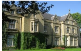
Audenshaw Local History Society