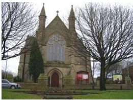
Friends of Old Chapel, Dukinfield