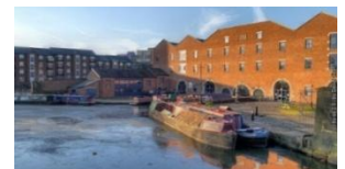
Tameside Museums & Galleries Service