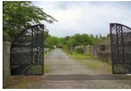
Friends of Gorse Hall