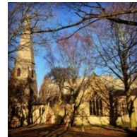
Hurst St Johns

Millbrook Great War Project and the 300 plus names missing from the Stalybridge War Memorial, plus an inventory of all the Tameside War Memorials