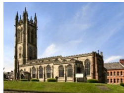
Friends of Ashton Parish