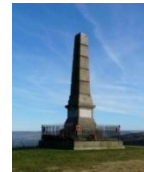
Hyde War Memorial Trust & Gee Cross WI