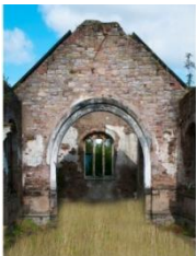
Friends of Dukinfield Old Hall Chapel

Millbrook Great War Project and the 300 plus names missing from the Stalybridge War Memorial, plus an inventory of all the Tameside War Memorials