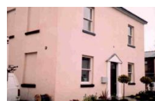
The historic Odd Whim pub is listed and saved from demolition