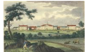
Fairfield Moravian Church, Settlement & Museum