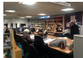
Tameside Local Studies & Archives Centre