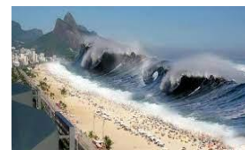
26 December - Thousands killed by the devastating Indian Ocean tsunami.