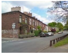
Currier Lane Area Residents Ass.