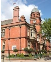
Theatre Royal Hyde, Living Memories of Hyde & Hyde Historical Society