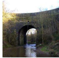
Hollinwood Canal Society