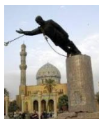
9 April - Saddam Hussein's regime loses control of Baghdad and his statue is toppled