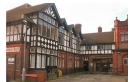
Denton Local History Society