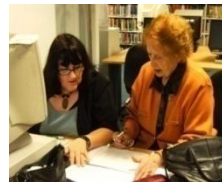
Cheshire Family History Society