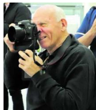
Ray Liddy photographer for the reporter from 1950s - 2020