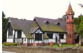
Denton - Police Station, Angel Public House & St Marys Church