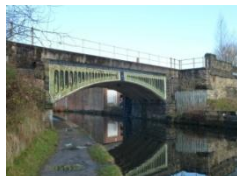
Dukinfield - Dukinfield Town Hall and Peak Forest Canal and Railway bridge.