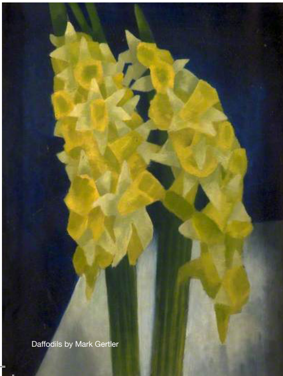
Daffodils by Mark Gertler